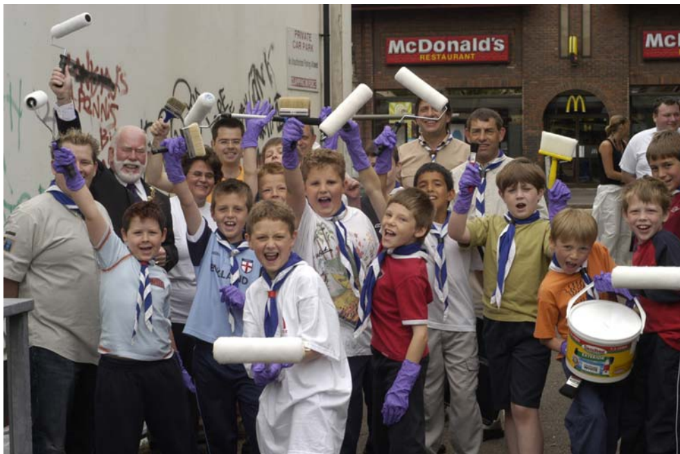
Some of the cubs with leaders and the Mayor ready to paint out the graffiti.

(There is a fuller article in the Romford Recorder for the week ending 1.7.05)